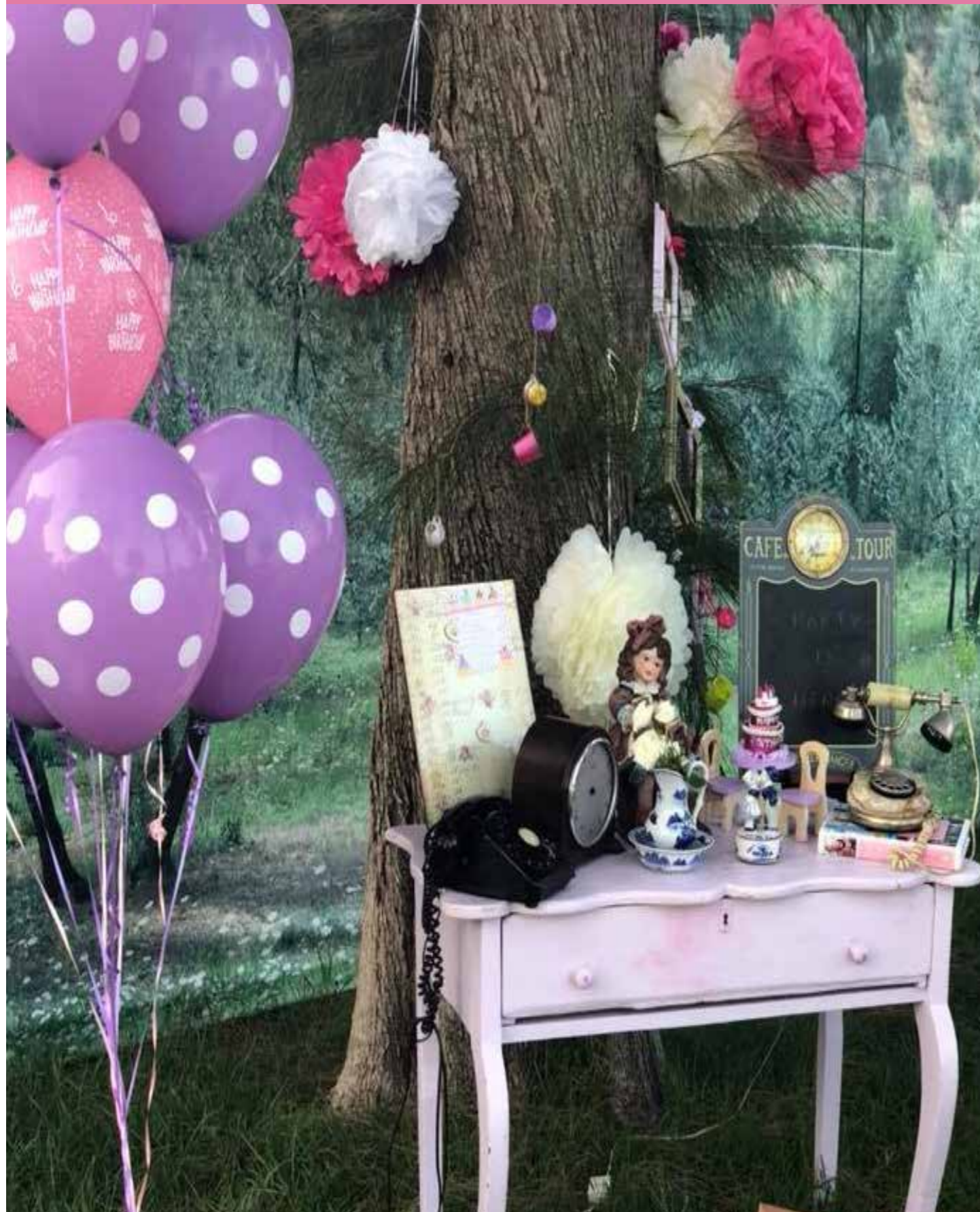
Alice In Wonderland