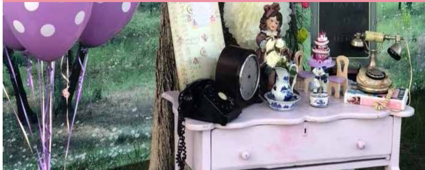
ALICE in Wonderland